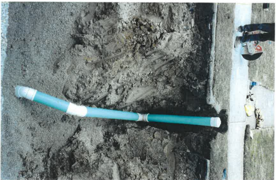
Figure 2.4.2. The pipe in the trench.