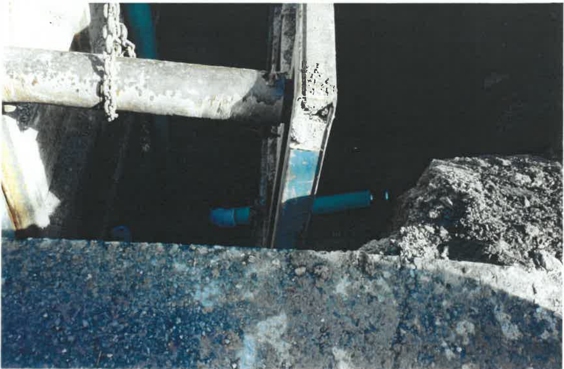
Figure 2.4.1. Installation of the pipe.